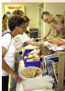
Ceramic Vendor Area