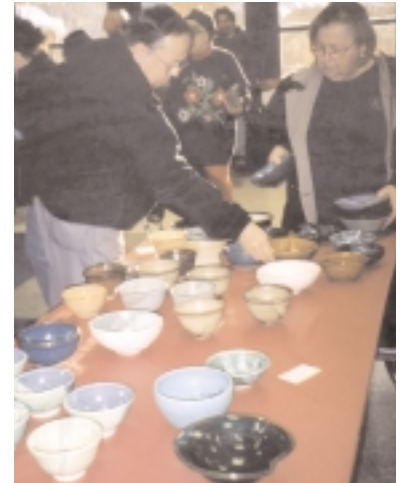
Guests select their bowls from a wide assortment.