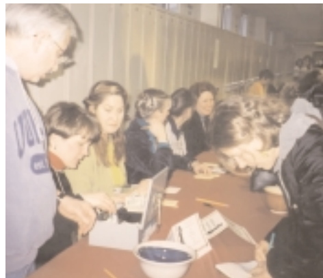
Scrapbook from Empty Bowls 2002