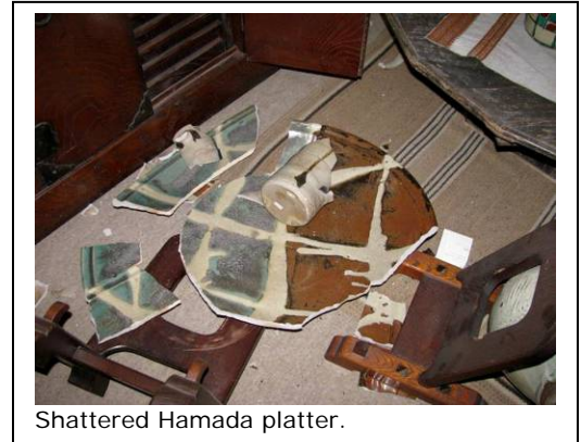
Shattered Hamada platter.