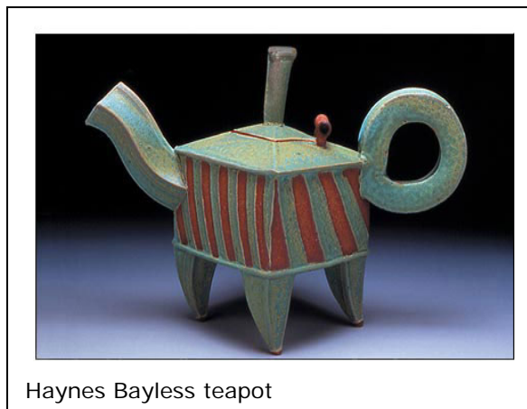
Haynes Bayless teapot

By now we hope that you have the weekend of September 29 to October 2 marked on your calendar and that you are planning to attend the 2011 Clay Conference.